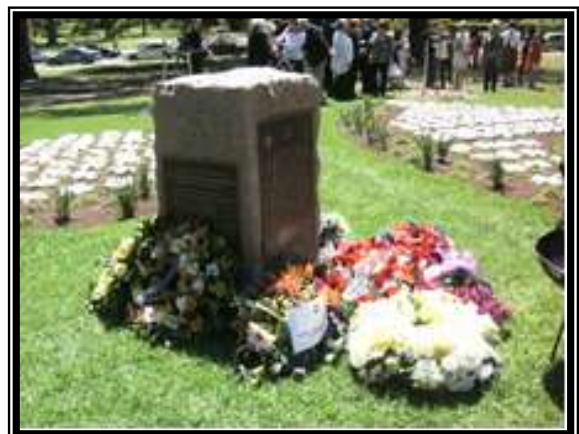
The cairn in the memorial garden, where various Servicewomen's Associations and Navy, Army and Air Force representatives laid wreaths.

The memorial garden is dedicated to the women who served and are serving Australia in the Navy, Army and Air Force, some 70,000 since the Boer War.